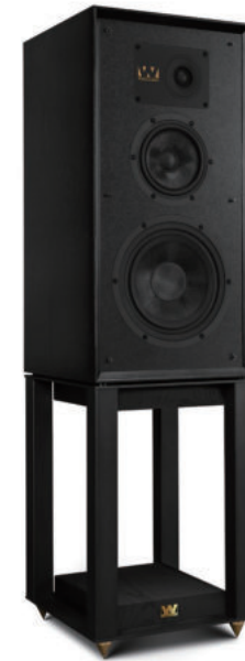
BLACK OAK finish